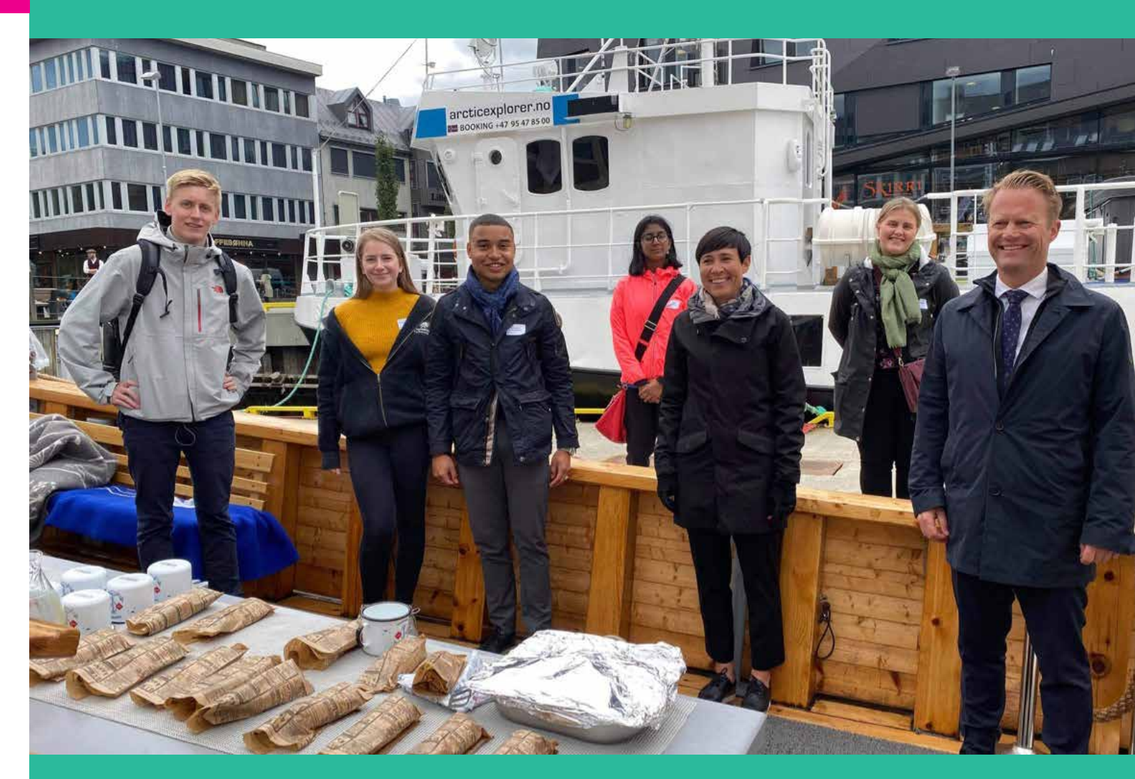
Figure 1.20 ce of involving

Infrastructure, the business sector, education cannot be discussed as separate topics because they all merge into each other. The same is true of value creation, climate change and the environment, health, integration, Sami issues, identity and culture. In this input from the youth panel all these topics are equally important and interlinked.