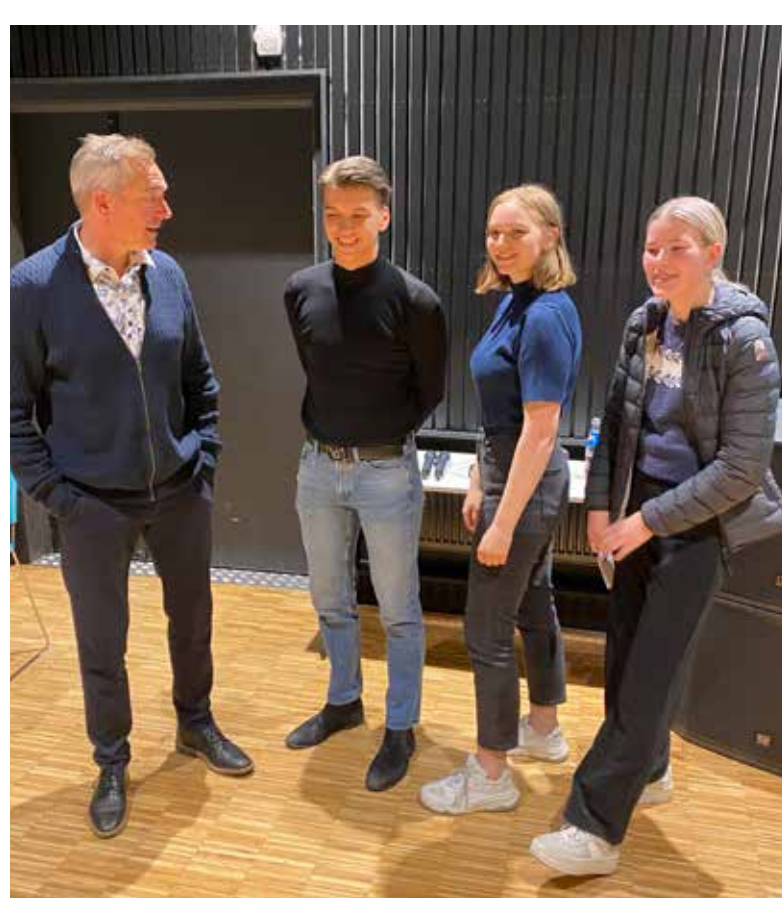
with the work on the white paper on the Arctic. Here Minister of Defence Frank Bakke-Jensen is talking to three young people from Kirkenes.