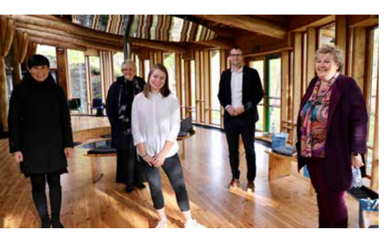
Skills development panel's recommend

identity. The authorities must not think they can just place all the responsibility on the Sámediggi (Sami parliament) and that will take care of all Sami issues. It is important to provide resources for language instruction for all young people in the north who want to learn Sami, and that there is greater awareness of the need to build language skills. We must preserve knowledge about Sami life and make sure we do not lose the knowledge that is not written down in books, that has to be learned. We have lost enough as it is through the Norwegianisation policy.